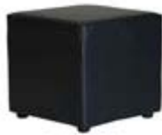
Square Ottoman $40