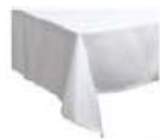
Trestle Cloth $20