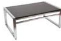
Large Coffee Table $100