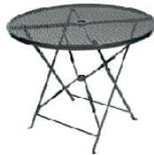
Steel Table $42