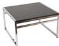
Small Coffee Table $90