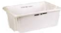
Tub & Ice $30