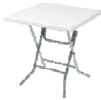
Square White $33