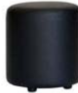
Round Ottoman $40