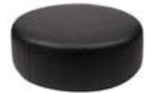
Circle Ottoman $210