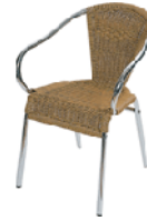
Wicker Chair $12