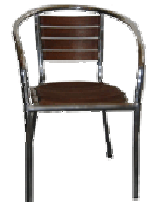
Timber Chair $16