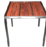
Timber Table $45