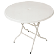
Plastic Table $28