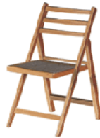
Roma Chair $12