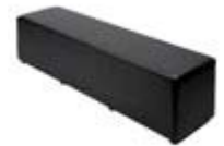
Bench Ottoman $220