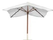
Market Umbrella $110